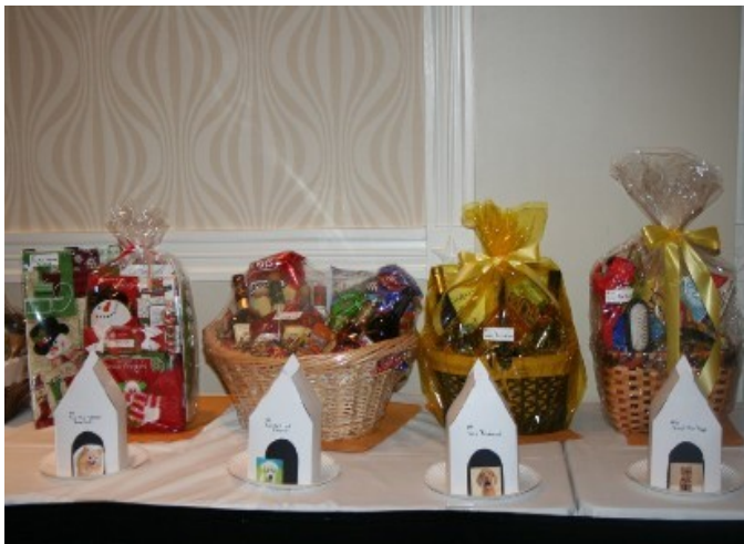
Charity Raffle Items