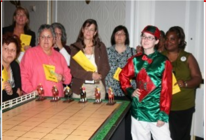
Playing the Ponies at the Social