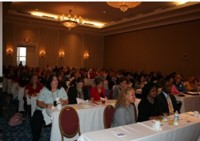
Breakout sessions were well attended