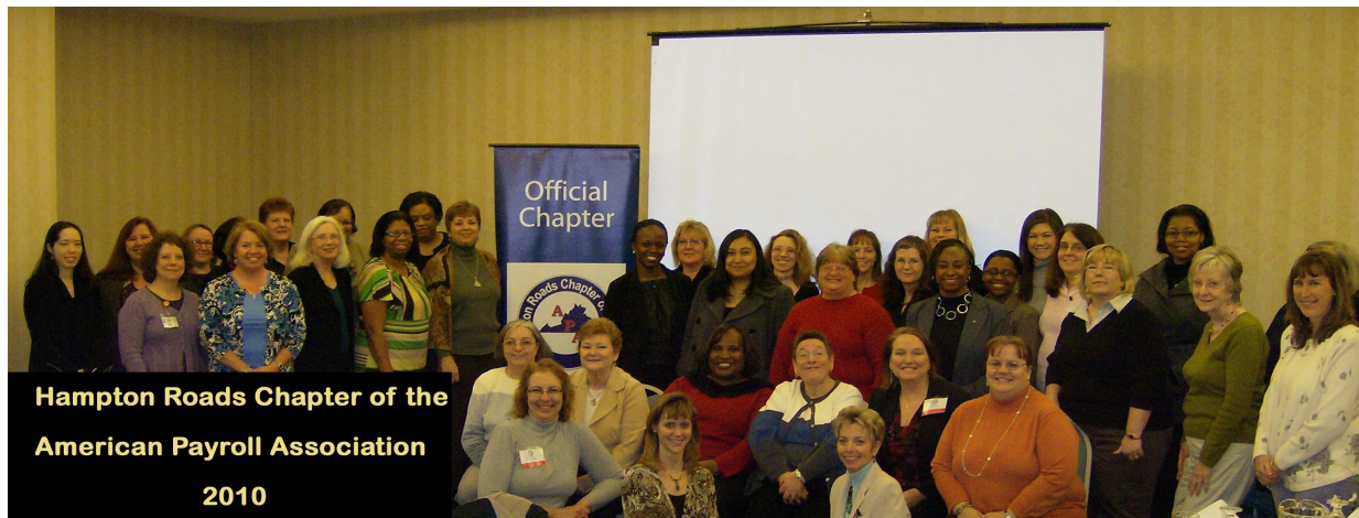
Hampton Roads Chapter of the American Payroll Association 2010